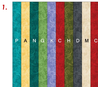
BLOCK 1 (make 15)