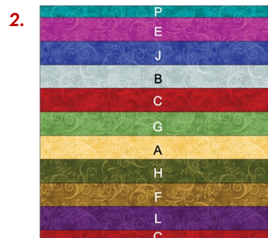
BLOCK 2 (make 15)