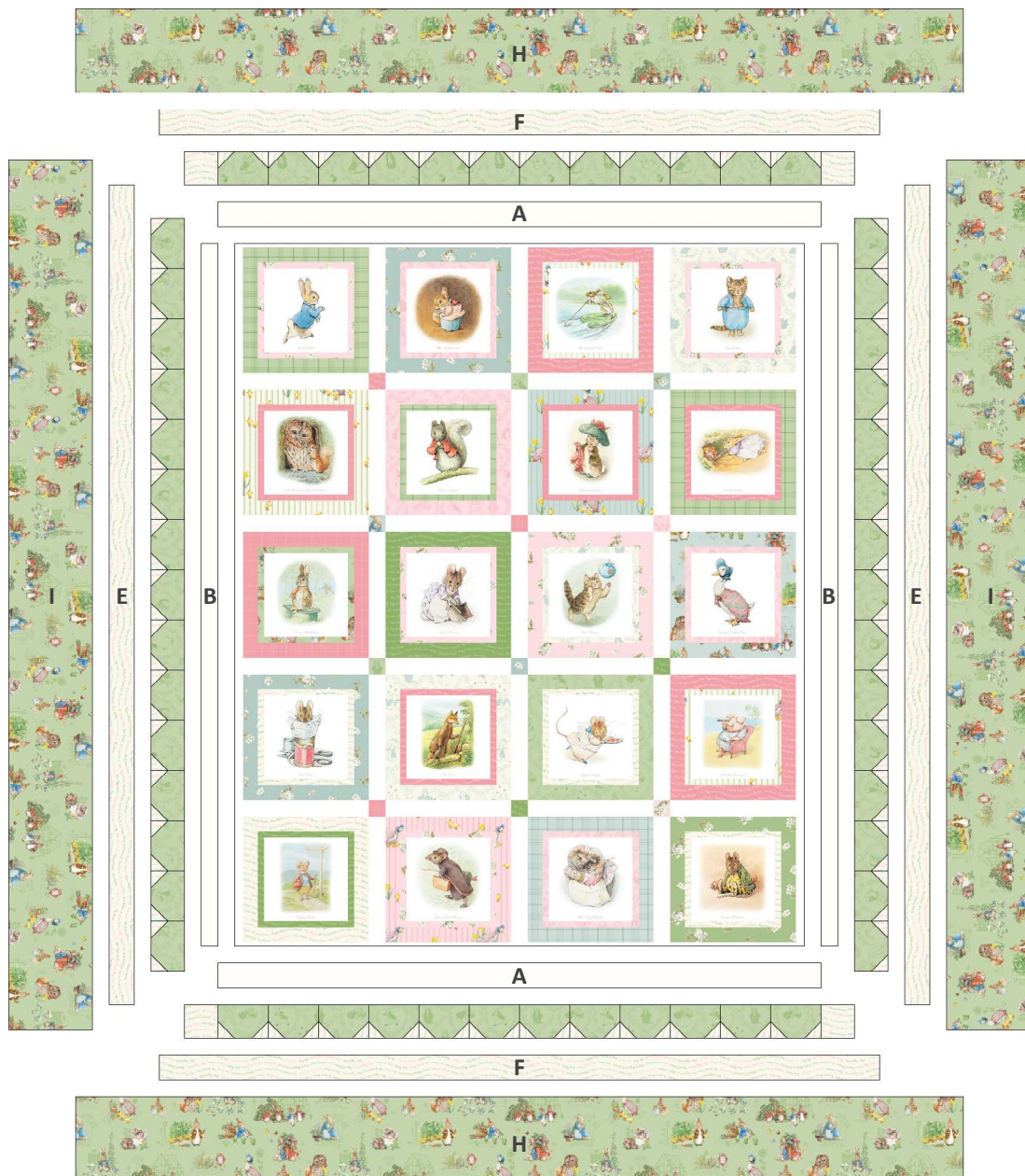
QUILT LAYOUT DIAGRAM