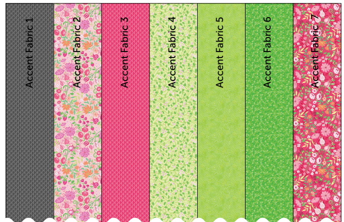
Diagram A (Make 2 strip sets)

Aligning raw edges, join 1 of each of 7 accent strips from the first step together, as shown in Diagram A, pressing all seams the same direction. Repeat with the second set of strips, joining strips in the same order, to form two identical strip sets.