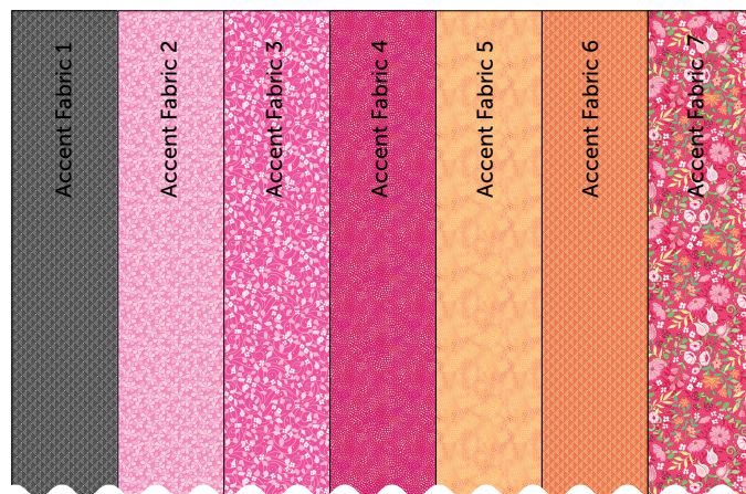
Diagram A (Make 2 strip sets)

Aligning raw edges, join 1 of each of 7 accent strips from the first step together, as shown in Diagram A, pressing all seams the same direction. Repeat with the second set of strips, joining strips in the same order, to form two identical strip sets.