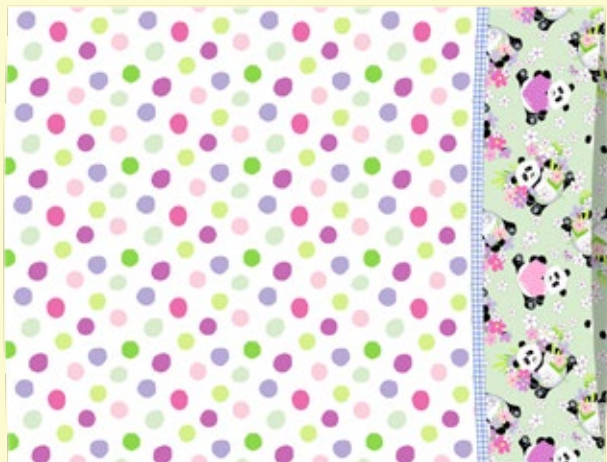
Standard Size Pillowcase

Includes complete instructions and link to a detailed video tutorial.