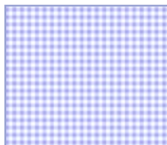
2" for flange