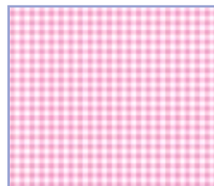
2" for flange