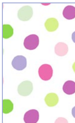
3/4 yd flannel for pillowcase body