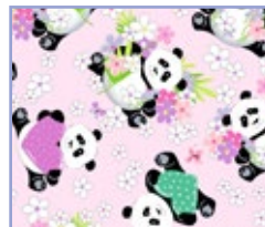
1/4 yard for cuff