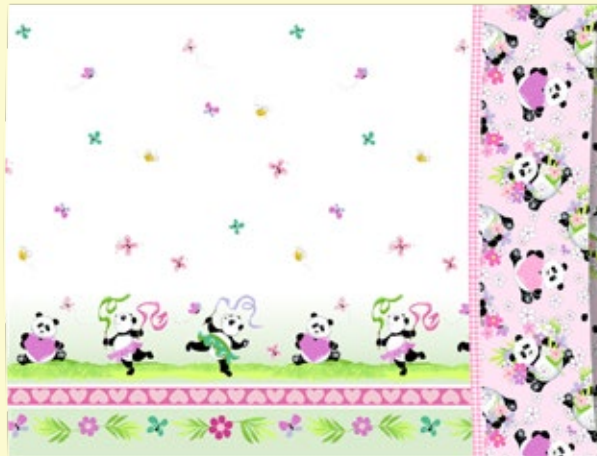
Standard Size Pillowcase

Includes complete instructions and link to a detailed video tutorial.