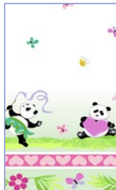
3/4 yd for pillowcase body