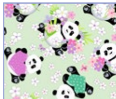
1/4 yard for cuff