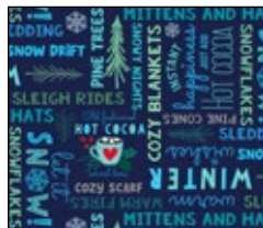
1/4 yard for cuff