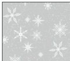
2" for flange