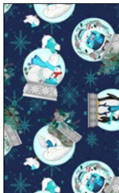
3/4 yd for pillowcase body