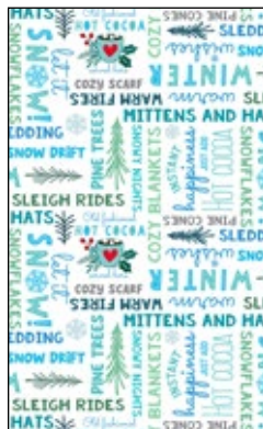
3/4 yd for pillowcase body