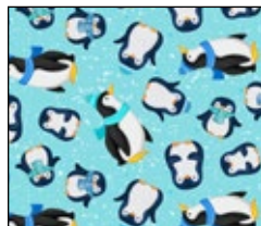
1/4 yard for cuff