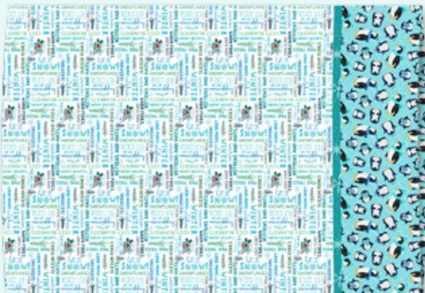
Standard Size Pillowcase

Includes complete instructions and link to a detailed video tutorial.