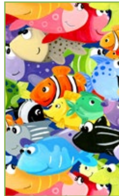
3/4 yd for pillowcase body