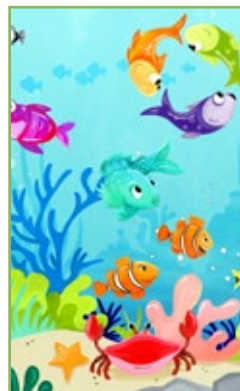
3/4 yd for pillowcase body