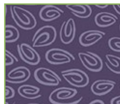
2" for flange