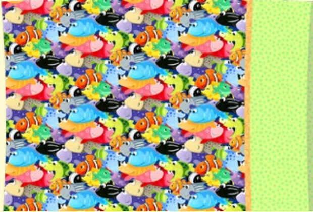
Standard Size Pillowcase

Includes complete instructions and link to a detailed video tutorial.