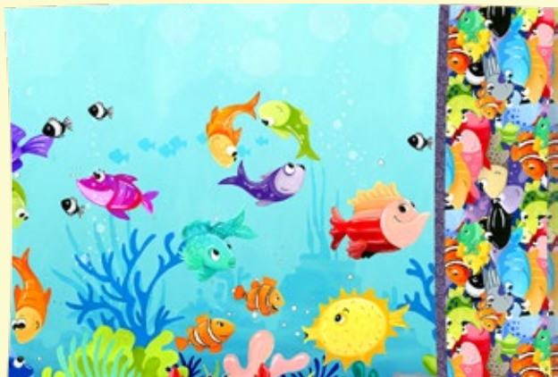
Standard Size Pillowcase

Includes complete instructions and link to a detailed video tutorial.