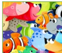
1/4 yard for cuff