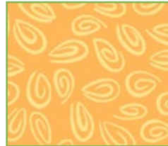
2" for flange