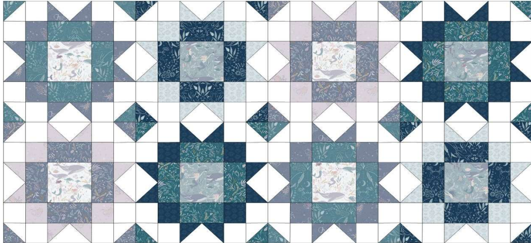
Rows 1 & 2

Place the blocks out as in the main diagram. Sew in rows pressing the seams in the opposite way each time as this will help when stitch the rows together.