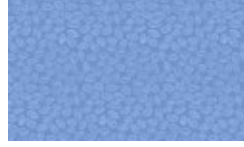
\frac{2}{3} yd. SB20103-760 (includes binding)