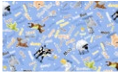
1\frac{1}{2} yd. SB20415-76 Suggested Backing