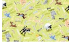
\frac{1}{3} yd. SB20415-815