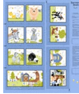
1 Panel SB20414-760