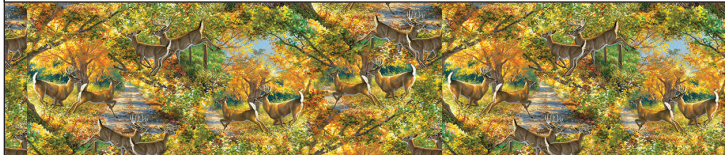
Morning Run (20727-MLT-CTN-D) – 1 yd (91.44 cm x 106.68 cm) Cut 6 – 4 ½ in x wof (11.43 cm x 106.68 cm)