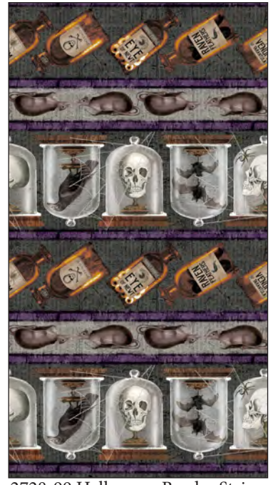
2728-99 Halloween Border Stripe Charcoal

Selected fabrics from the Jot Dot Collection