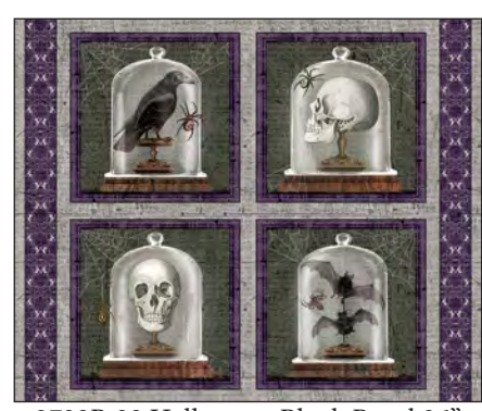
2729P-99 Halloween Block Panel 36" Charcoal