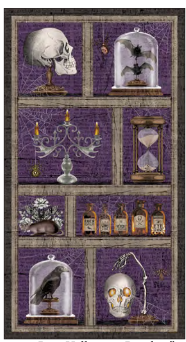
2730P-55 Halloween Panel 24" Purple