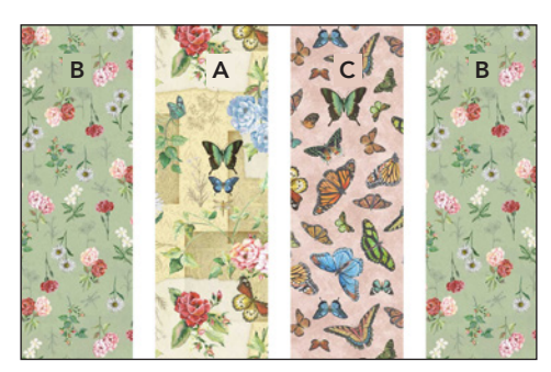
MAKE (1) FOR PIECED ROW 2

2. Pieced Row 2: Arrange and sew together (2) B 5-1/2" x 15-1/2" rectangle, (1) A 5-1/2" x 15-1/2" rectangle, (1) C 5-1/2" x 15-1/2" rectangle, and (3) E 1-1/2" x 15-1/2" sashing rectangles to make a pieced row.