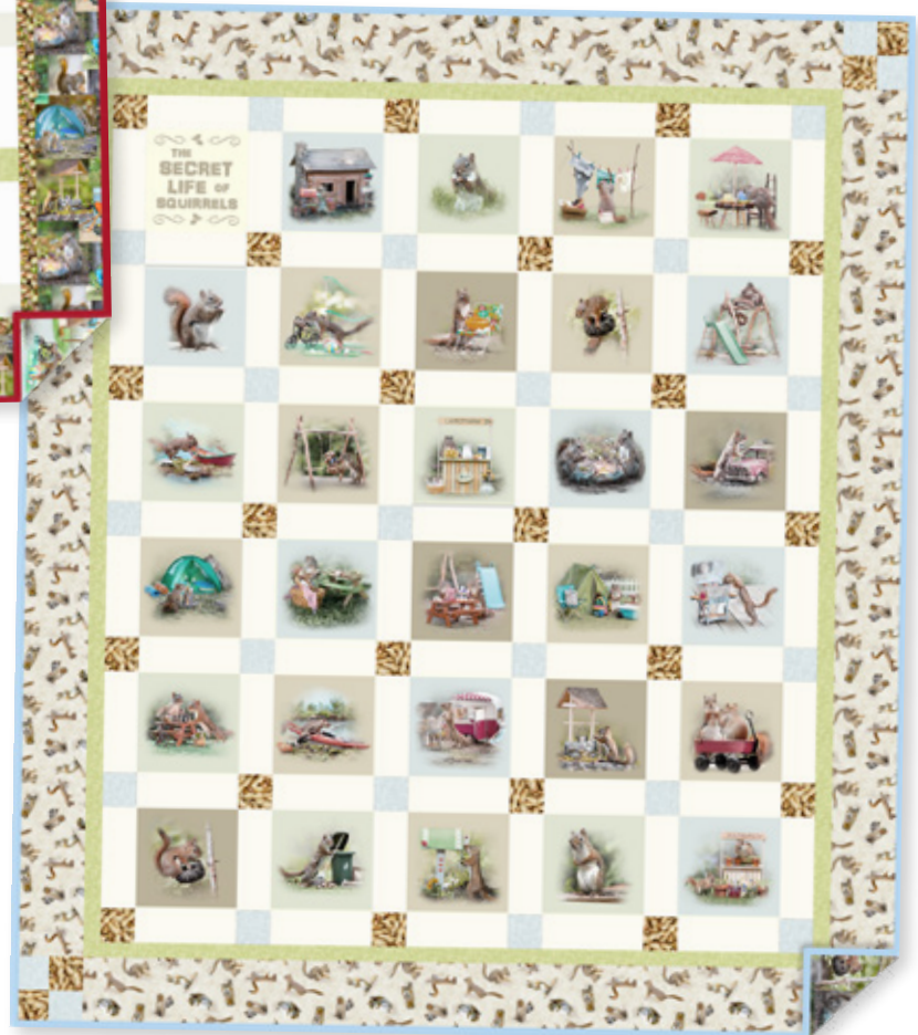
Khaki Border Version