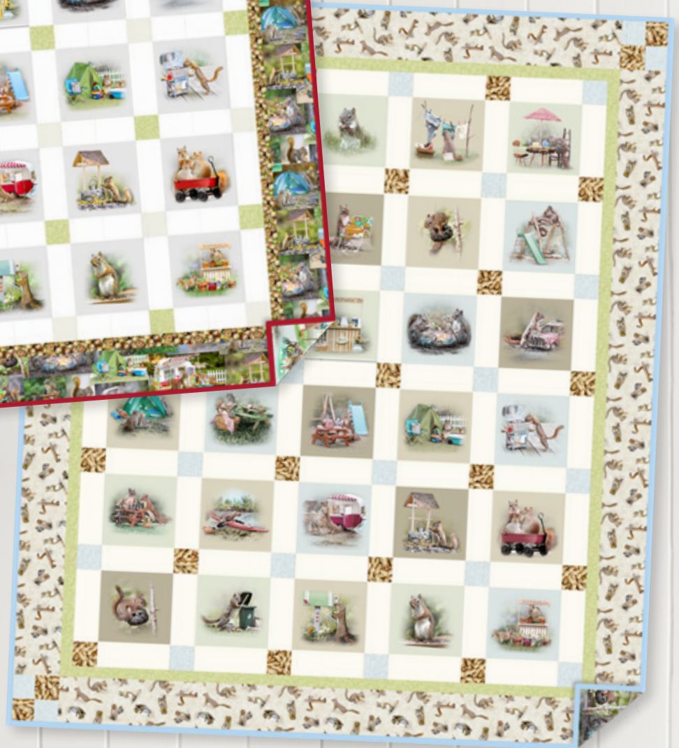
Khaki Border Version