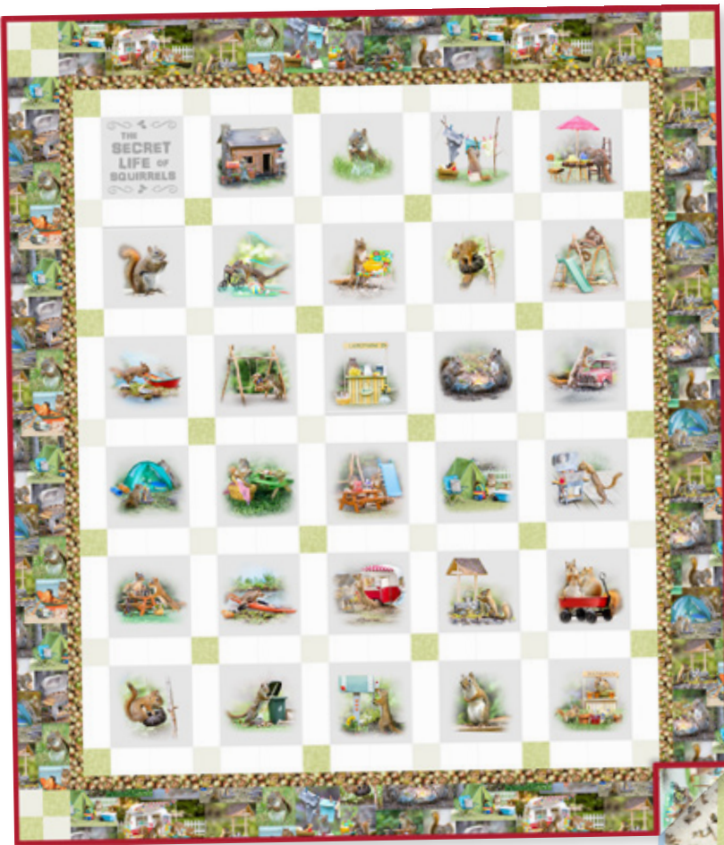
Multicolor Border Version