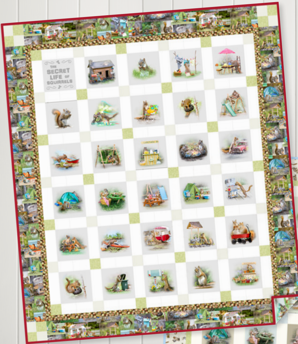
Multicolor Border Version