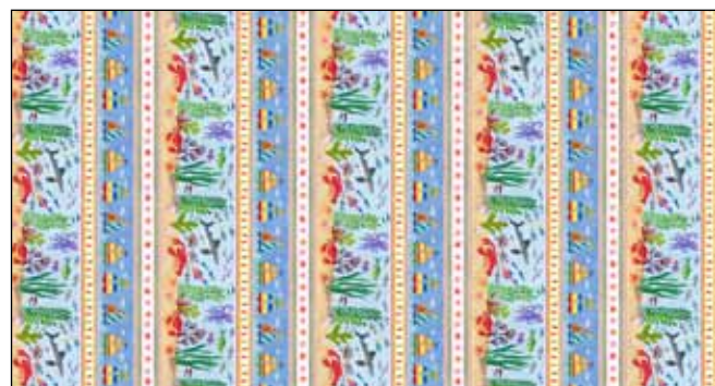
DBSE 4834 MU