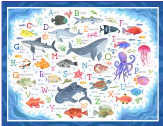
DBSE 4832 PA