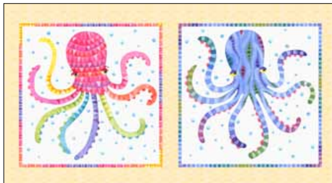
DBSE 4833 PA*