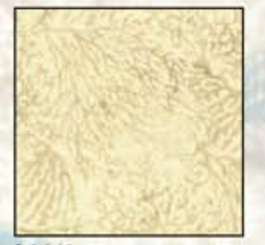
L2643 A25-Antique Beige