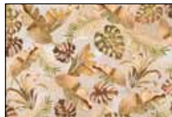
BSAN 4843 ZZ