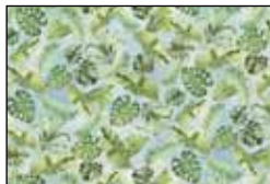
BSAN 4843 G†