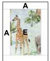
Figure 1 Make 3.