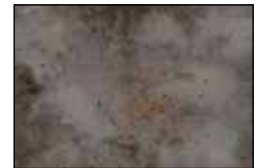
BSAN 4844 S*