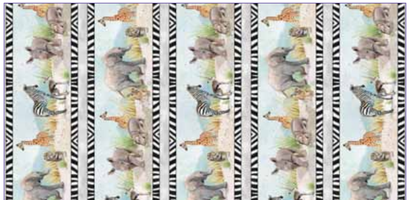
BSAN 4842 MU*