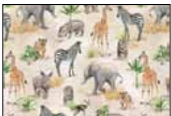
BSAN 4845 ZZ