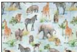
BSAN 4845 MU*