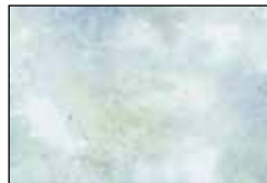
BSAN 4844 B