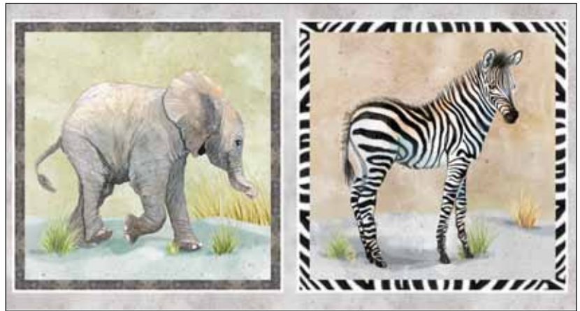
BSAN 4841 PA