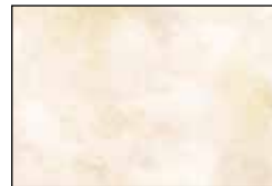
BSAN 4844 E