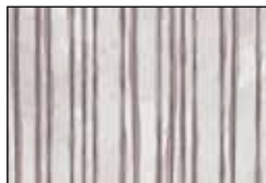
BSAN 4846 S