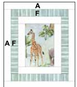
Figure 2 Make 3. 10 1/2" x 12 1/2" unfinished