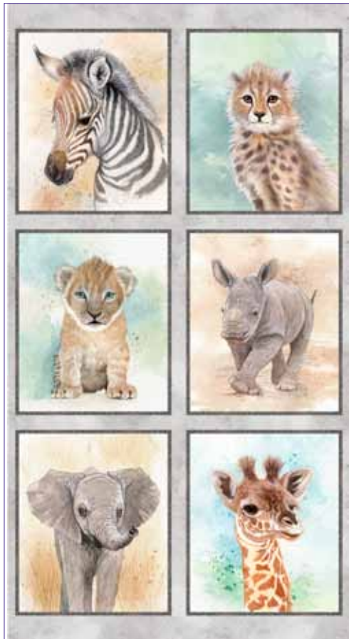
BSAN 4840 PA*

Fabric Collection by Clint Eggar for P&B Textiles