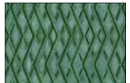
BSAN 4847 G