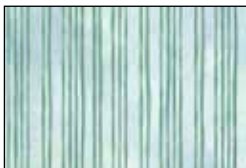
BSAN 4846 G*