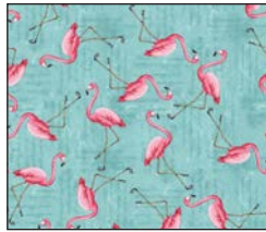
2371-76 Flamingos Aqua