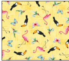
2372-44 Tropical Birds - Yellow