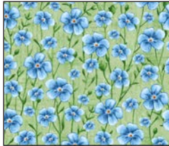
2366-70 Small Flowers Lt. Blue