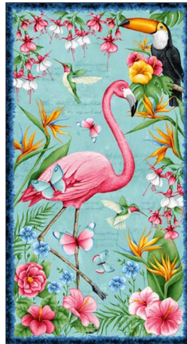
2375P-76 Tropical Panel Aqua