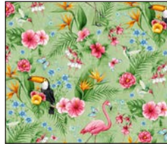
2367-60 Tropical Birds & Flowers - Lt. Green