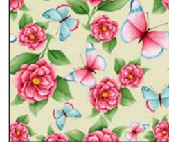
2369-41 Butterfly & Rose - Ivory