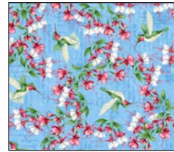
2373-70 Hummingbirds Lt. Blue