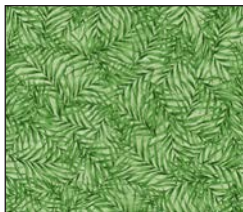
2374-60 Leaf Allover Lt. Green