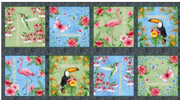
2365-95 Tropical Blocks Charcoal

Selected fabrics from the Chameleon Collection