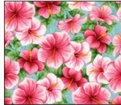
2368-22 Hibiscus Pink