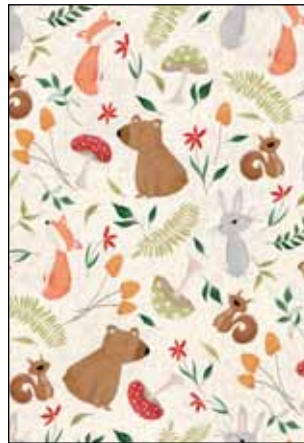
FFAM 4777 MU*