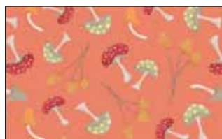
FFAM 4780 O