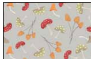
FFAM 4780 S