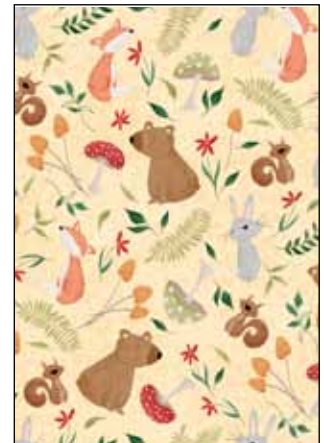
FFAM 4777 Y