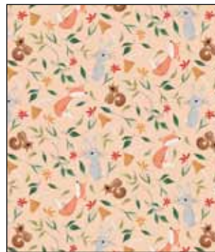
FFAM 4783 J