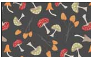
FFAM 4780 K