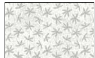
FFAM 4781 LS