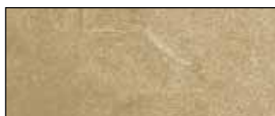
SUED 300 LZ*