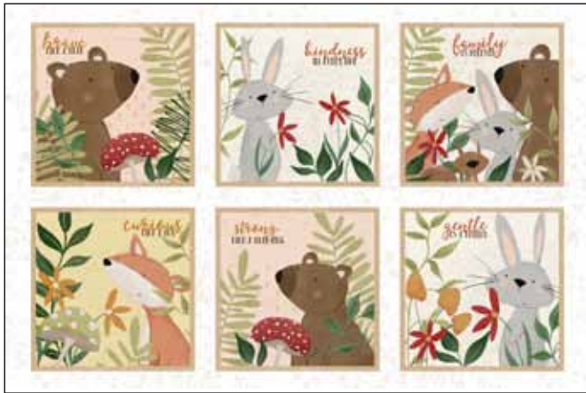
FFAM 4776 PA*

Fabric Collection by Deane Beesley Designs Inc. for P&B Textiles