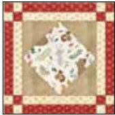
Figure 6 Make 4. 8" x 8" unfinished.