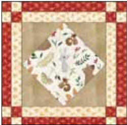
Figure 5 Make 4. 12 1/2" x 12 1/2" unfinished.