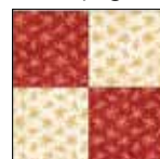
Figure 3 Make 16. 2 1/2" x 2 1/2" unfinished.