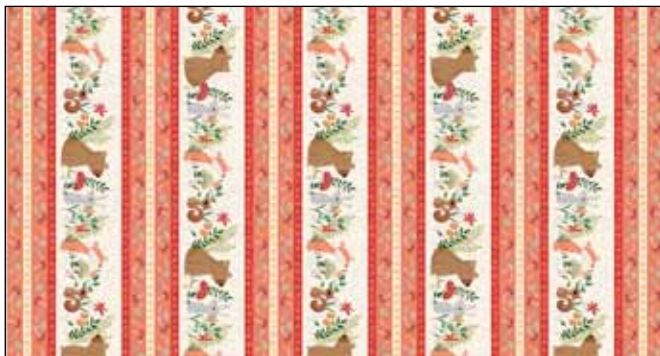
FFAM 4778 MU*