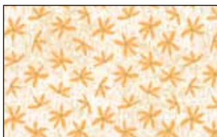
FFAM 4781 LY*