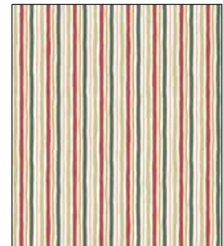
FFAM 4779 MU