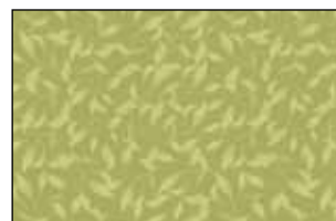
FFAM 4782 G