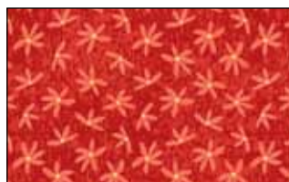
FFAM 4781 R*