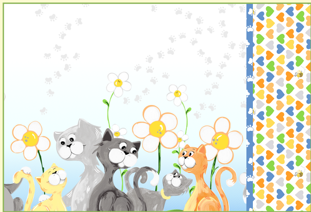
Standard Size Pillowcase

Includes complete instructions and link to a detailed video tutorial.