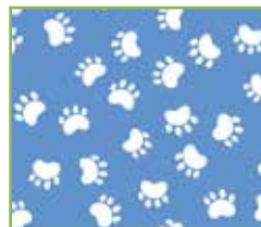
2" for flange