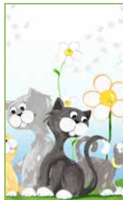
3/4 yd for pillowcase body