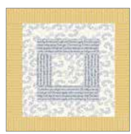
Around the Block

Sew an assorted print 2%" x 16%" rectangle to the top and bottom of Unit D to complete the Around the Block. Repeat to create 12 Around the Blocks.