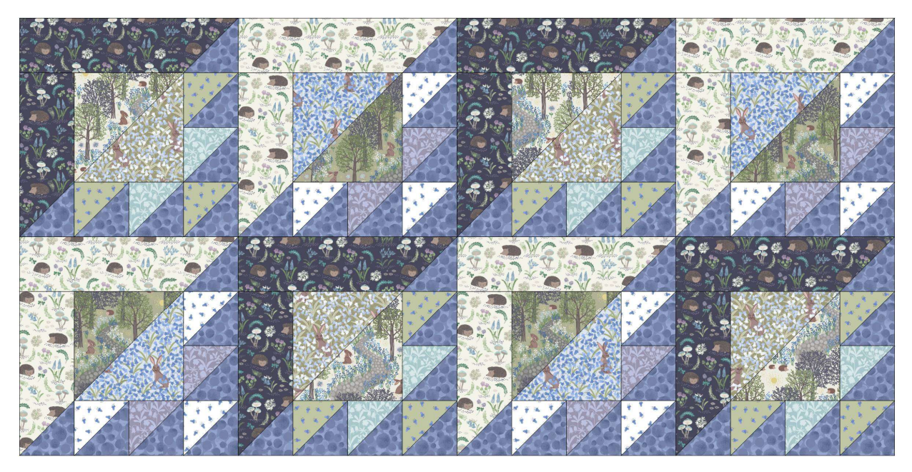
Row 1 & 2

Lay out all the blocks as in the main diagram.