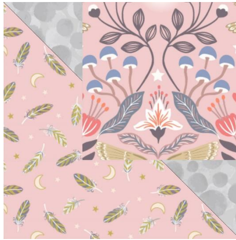
top right corner of block

Sew the small triangles to each end of the strip pieces. Next stitch the short strip to the square and press back. Sew the other strip to the block.