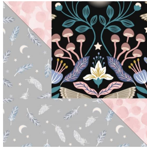
top right corner of block

Sew the small triangles to each end of the strip pieces. Next stitch the short strip to the square and press back. Sew the other strip to the block.