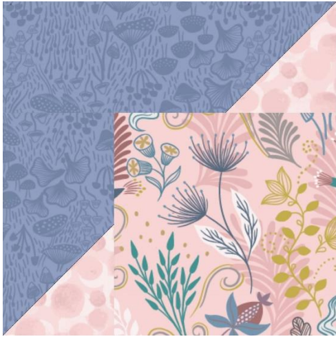
Top left corner of block