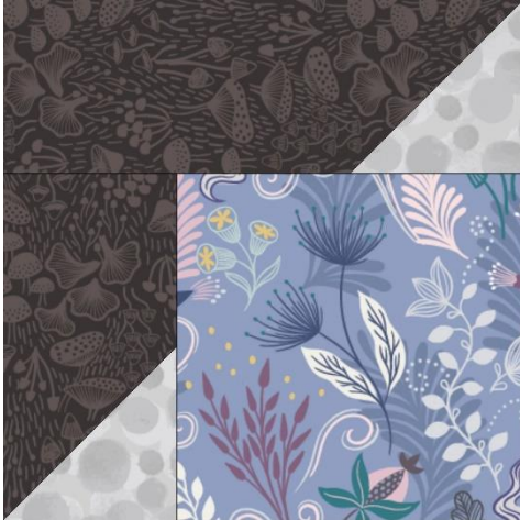
Top left corner of block

Both blocks are made up in the same way. Lay out the fabric pieces for block 1