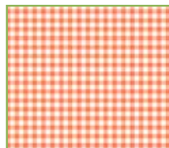
2" for flange