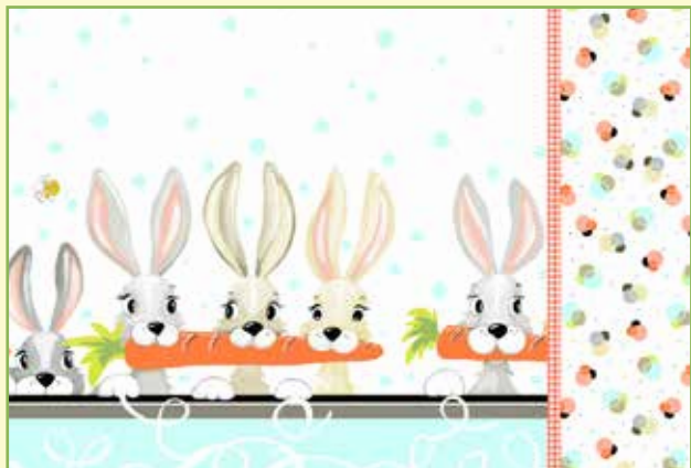
Standard Size Pillowcase

Includes complete instructions and link to a detailed video tutorial.