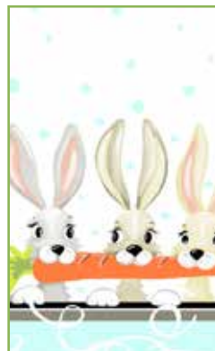
3/4 yd for pillowcase body