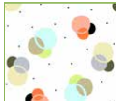
1/4 yard for cuff