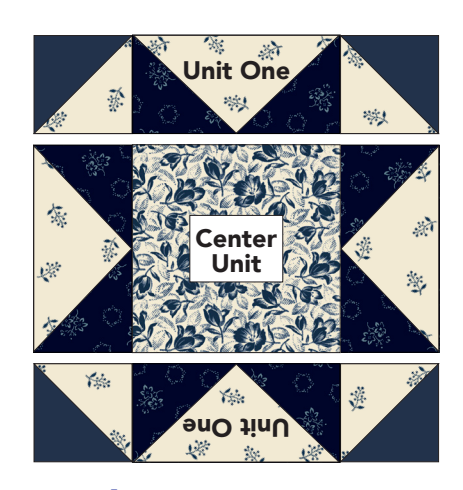
MAKE 18 Star Blocks