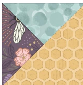
Block 3 B