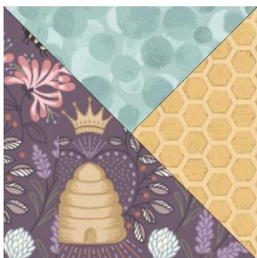
Block 3 A

This is made up of two blocks. The lay-out of block 3 A is for the top & bottom and block 3 B is for the sides.