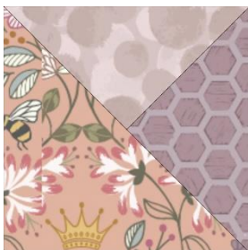
Block 3 A

This is made up of two blocks. The layout of block 3 A is for the top & bottom and block 3 B is for the sides.