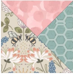
Block 3 A