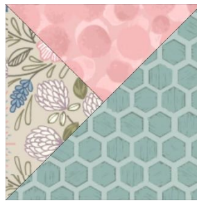
Block 3 B

Lay out the fabrics for each block as in the colour ways in the main diagram for block 3. Sew the two small triangles together and then sew this to the larger triangle to make a square. Do this to all your blocks, 3 A and 3 B. Sew the strips together as in the main diagram. Sew the side strips to the quilt.