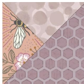
Block 3 B