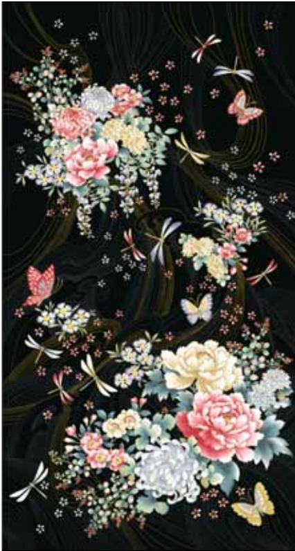
NIWA 4384 PA*