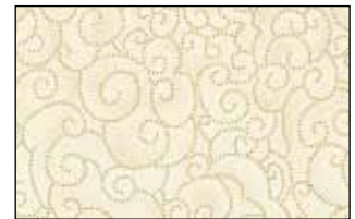
NIWA 4389 E