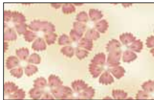
NIWA 4388 LP*