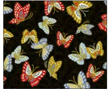
NIWA 4386 K