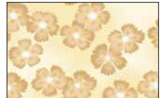
NIWA 4388 AU