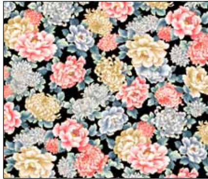
NIWA 4385 K†