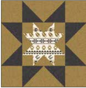
Corner Star Block

Sew a Unit F to the top and bottom of Unit E to create the Corner Star Block. Repeat to make a 4 Corner Star Blocks.