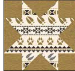
Corner Star Center

Sew a Unit D to the top and bottom of Unit C to create the Corner Star Center. Repeat to make a total of 4 Corner Star Centers.