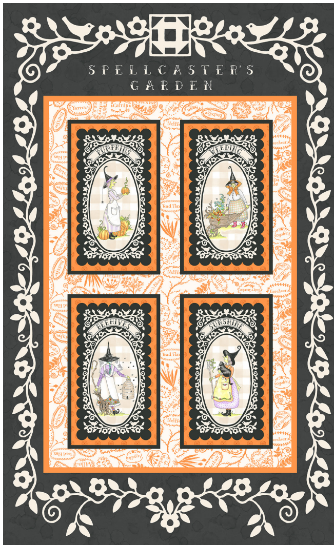
Fabric 1 Panel 9810-KJ