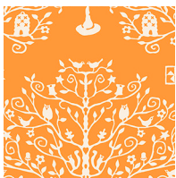
Fabric 2 9815-O