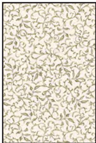
9847-41 Scroll Ivory