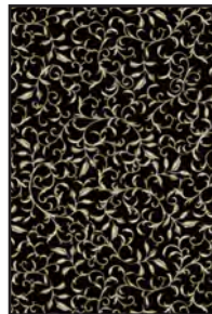
9847-99 Scroll Black