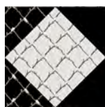
Figure 6 – Make 40.

6. Draw a diagonal line on the wrong side of the 2-1/2" Eclipse 3955 Jet Black squares. With right sides together, place one marked Jet Black square on a corner of one 4-1/2" 9848-90 Lattice Buds-Lt. Gray square and stitch on the drawn line. Trim seam allowance to 1/4" and press open. Repeat with the adjacent corner. In the same manner, sew two 2-1/2" 9848-99 Lattice Buds-Black squares to the opposite adjacent corners of the same square. Repeat to make forty patches ( figure 6 ).