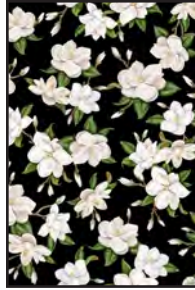
9844-99 Large Magnolia Black