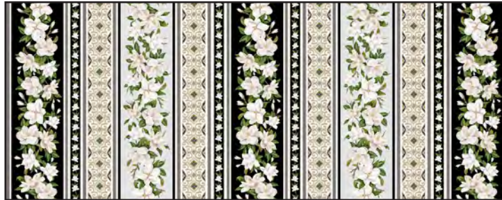
9850-99 Stripe - Black