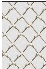
9848-90 Lattice Buds Lt. Gray