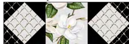
Figure 8 – Make 10.

8. Noting fabric orientation, sew one 4-1/2" 9844-90 Large Magnolia-Lt. Gray square in between two step 6 patches ( figure 8 ). Press the seams toward center. Repeat to make ten strips.