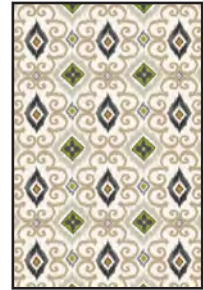
9849-41 Ikat Ivory

Selected fabrics from the Eclipse Solids Collection