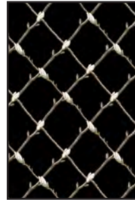
9848-99 Lattice Buds Black