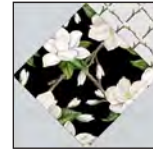
Figure 7 – Make 40.

squares (stitched to three corners), the 2-1/2" 9848-90 Lattice Buds-Lt. Gray squares, and the 4-1/2" 9845-99 Small Magnolia-Black squares to make forty 4-1/2" patches ( figure 7 ).