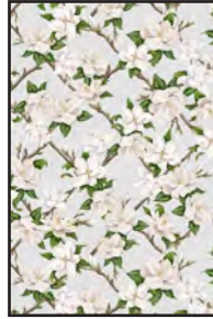
9845-90 Small Magnolia Lt. Gray