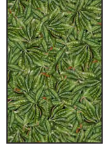
9846-66 Leaves Green