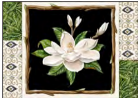
Figure 4 – Make 10.

4. Noting fabric orientation, sew one step 3 strip to the left and one to the right side of the 9-1/8" 9843-99 Magnolia Blocks-Black ( figure 4 ). Press the seams toward the center.