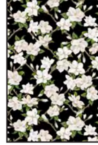
9845-99 Small Magnolia Black