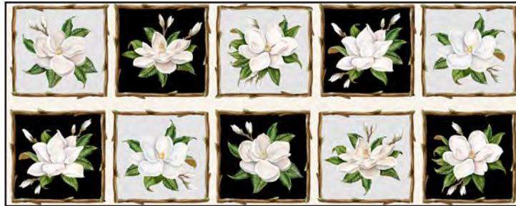
9843-99 Magnolia Blocks - Black