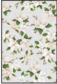
9844-90 Large Magnolia Lt. Gray