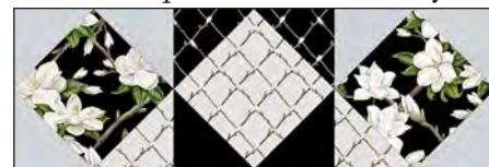
Figure 9 – Make 20.

9. Noting fabric orientation, sew one step 6 patch in between two step 7 patches ( figure 9 ). Press the seams away from center. Repeat to make twenty strips.