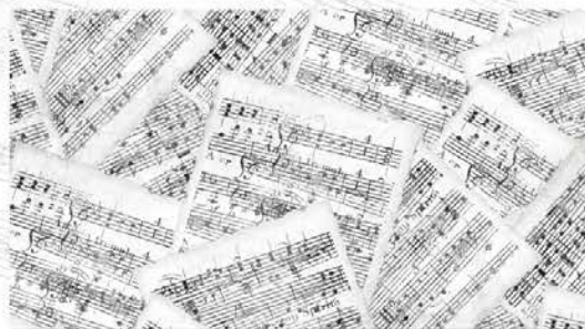
D 3009-24056-199 1 3/4 yds. (backing only)