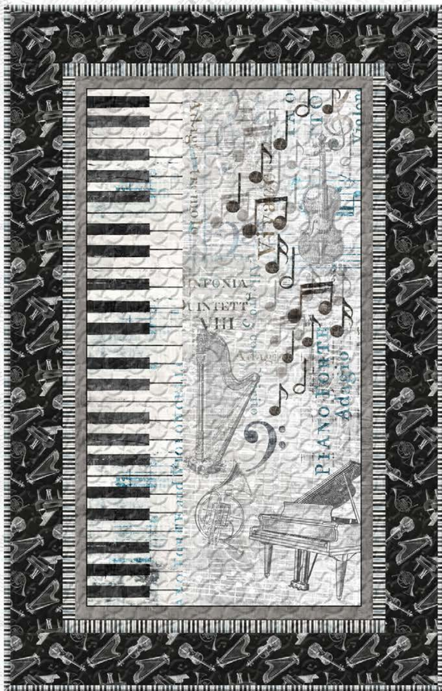
Wall Hanging Quilt: 33" x 51 1/2"