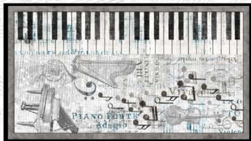
A 3009-24052-914 2/3 yd. (1 panel)