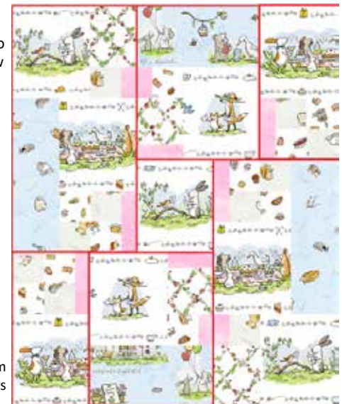
Color Diagram Showing Pieced Units