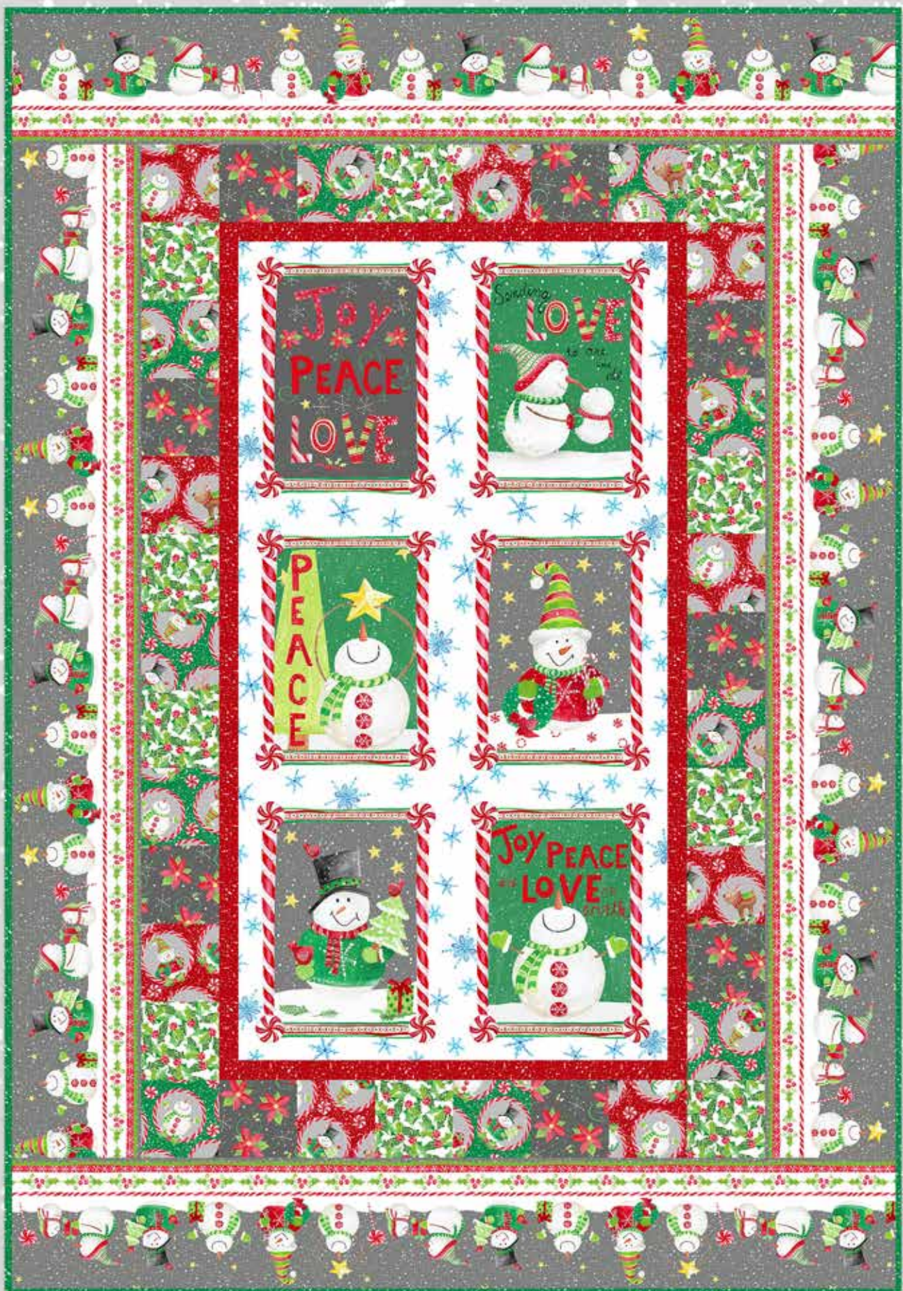
Joy, Peace and Love Quilt