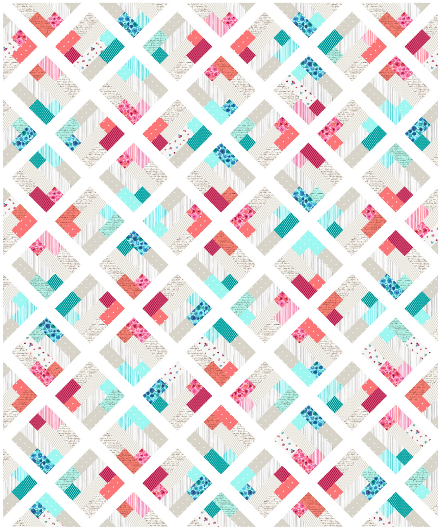
Quilt Assembly Diagram

While all possible care has been taken to ensure the accuracy of this pattern, we are not responsible for printing errors or the way in which individual work varies.