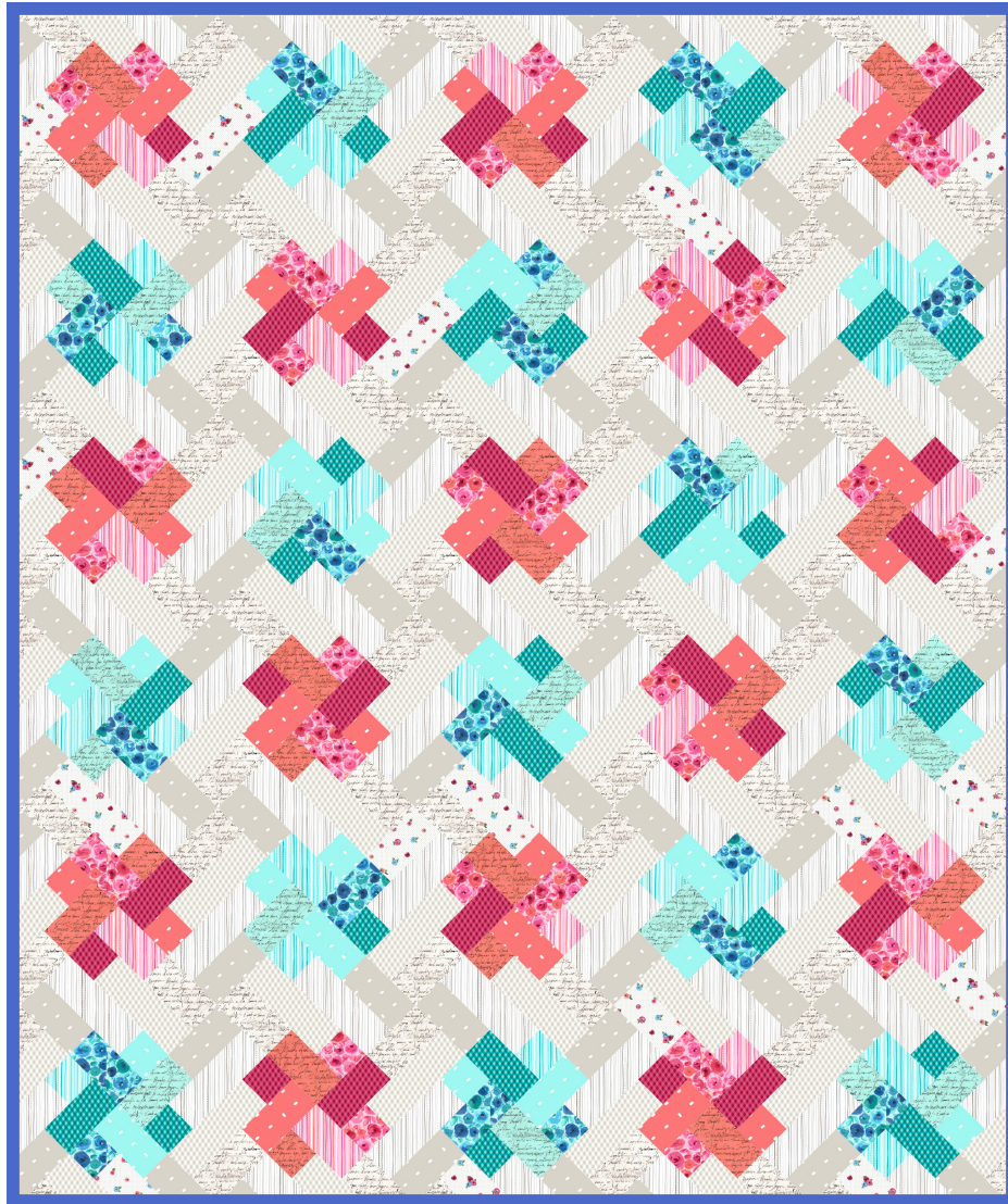
Finished Size: 56" x 68"