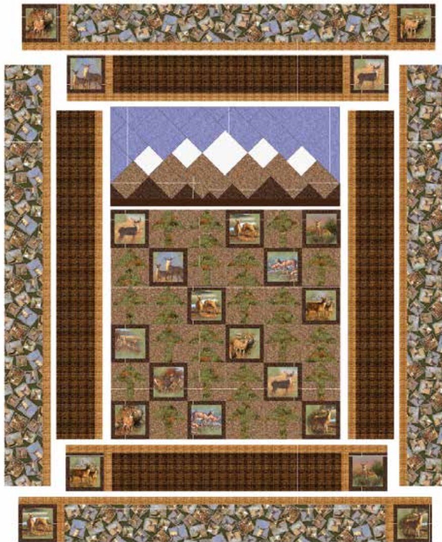
Quilt Assembly Diagram

While all possible care has been taken to ensure the accuracy of this pattern, we are not responsible for printing errors or the way in which individual work varies.