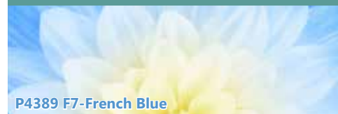
P4389 F7-French Blue