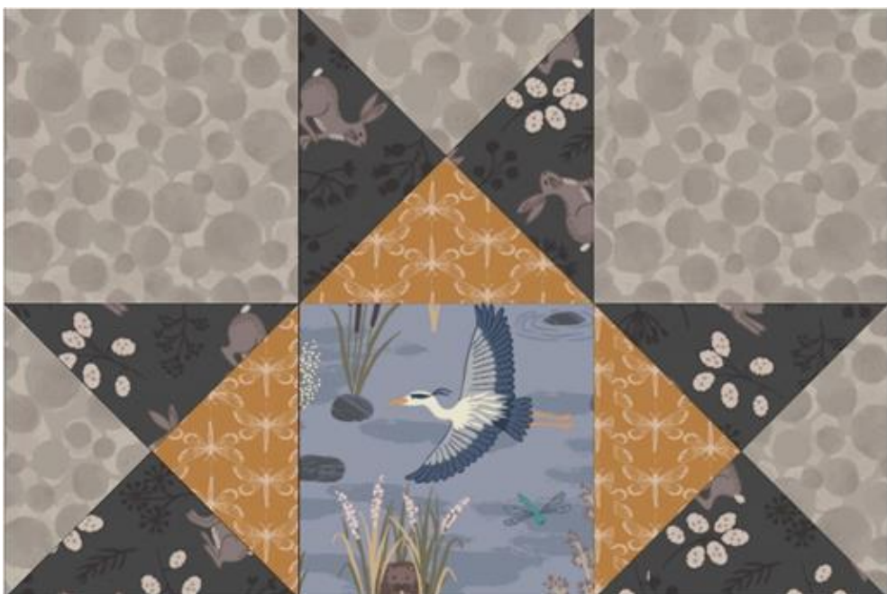
Figure 2: Pieced squares either side

Sew the rows together to complete the runner top