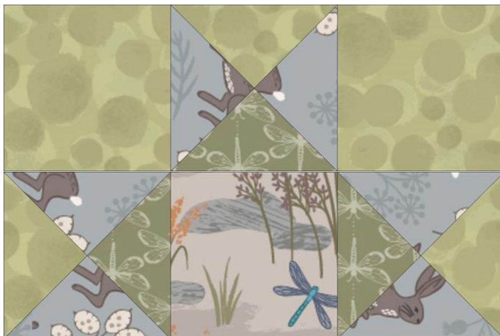
Figure 2: Pieced squares either side

Sew the rows together to complete the runner top