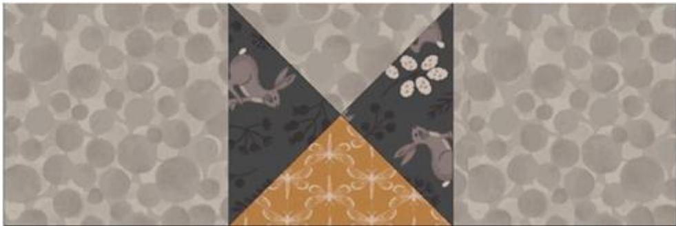
Figure 1: Pieced square in the centre

Sew the pieced squares and fabric squares in rows, as shown in the Table Runner diagram