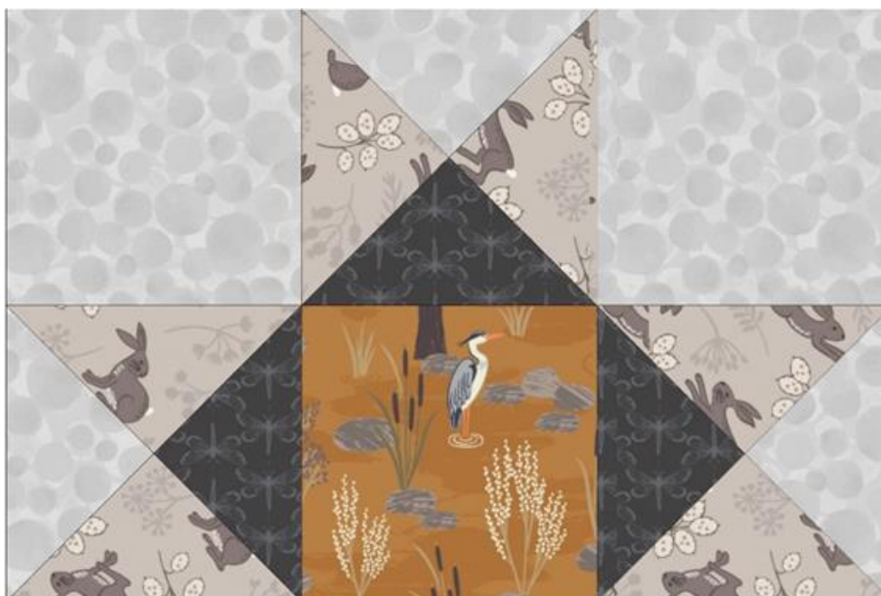
Figure 2: Pieced squares either side

Sew the rows together to complete the runner top