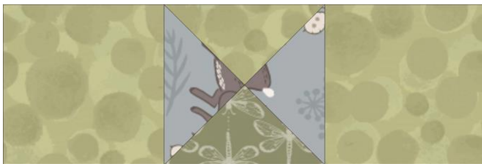
Figure 1: Pieced square in the centre

Sew the pieced squares and fabric squares in rows, as shown in the Table Runner diagram