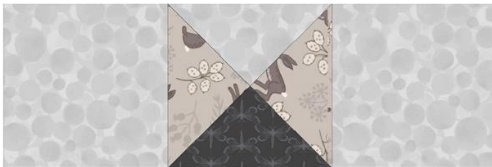
Figure 1: Pieced square in the centre

Sew the pieced squares and fabric squares in rows, as shown in the Table Runner diagram