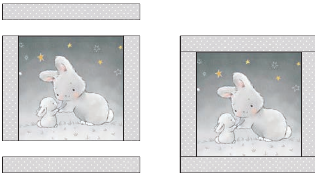
Block B Make 6.