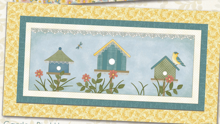
Garden Bird Houses