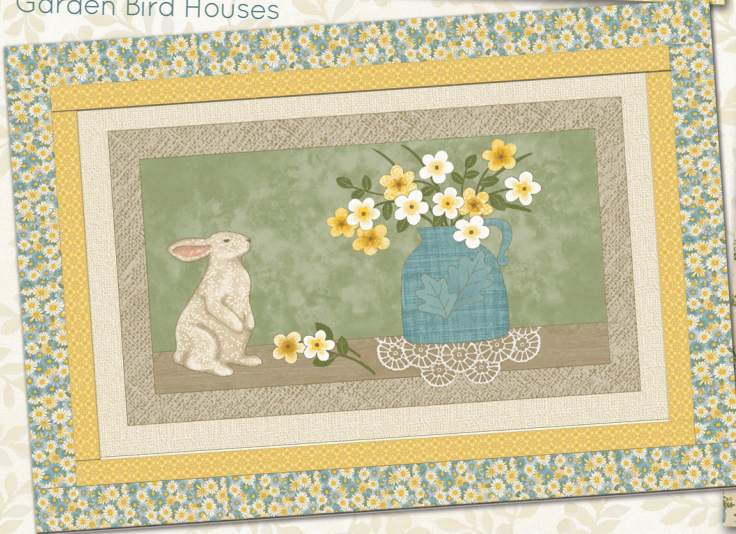
Fresh Cut Flowers Pillow