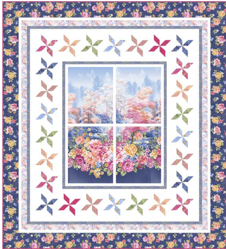
Finished Size: 79½" x 87½"