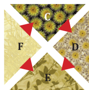
BLOCK 1 (Make 9)

1. Sew C, D, E, and F QST's together to make BLOCK 1 as shown in diagram below. Square to 7-1/2" square. Make 9 BLOCK 1 's.