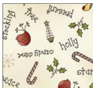
26558 – MUL 1