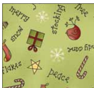
26558 – GRE 1