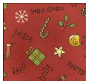
26558 – RED 1