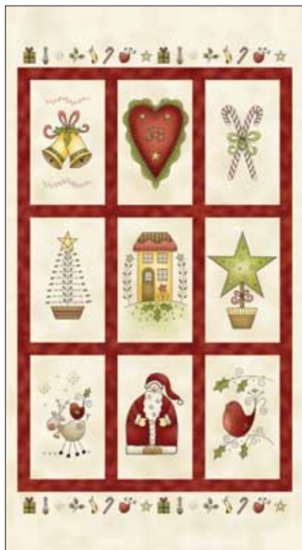
26557 – MUL 1