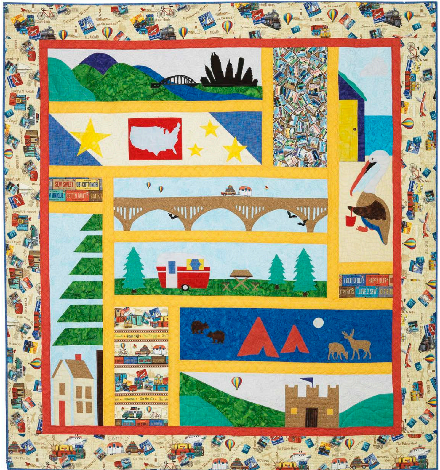
Finished quilt size: 73½" x 79½"