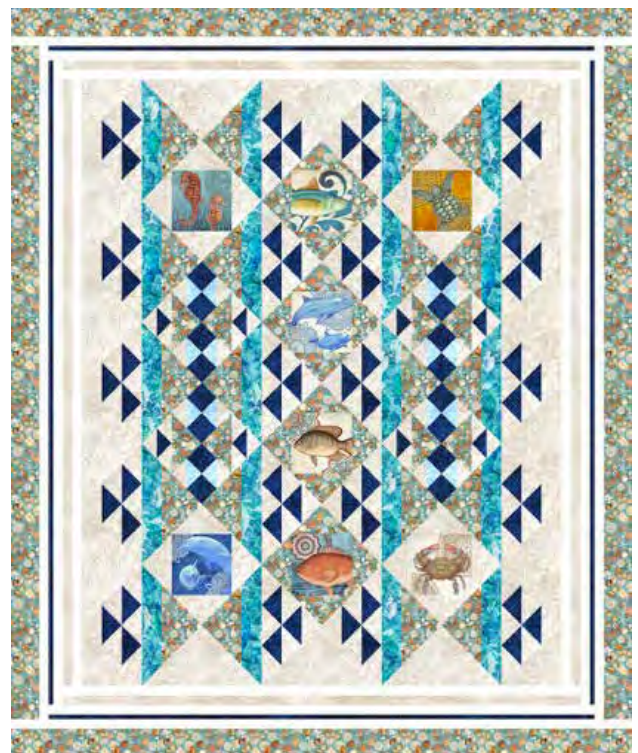
Exploded Quilt Diagram