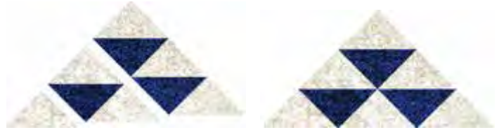
Pieced Triangle - Make 20