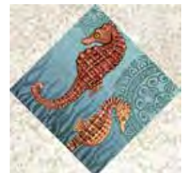
Light Diagonal Square Block - Make 4