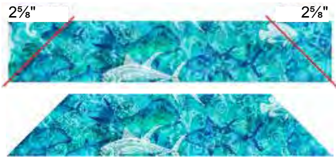
Angled Strip - Make 20