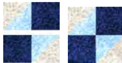
Four-Patch Unit - Make 8