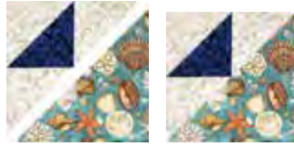
Fish Unit - Make 8