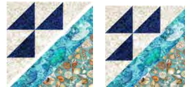
School of Fish Block - Make 20