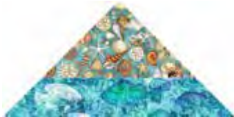
Stripe Triangle - Make 20