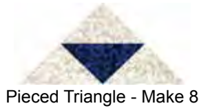
Pieced Triangle - Make 8