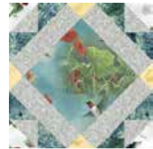
Make 6 B Blocks