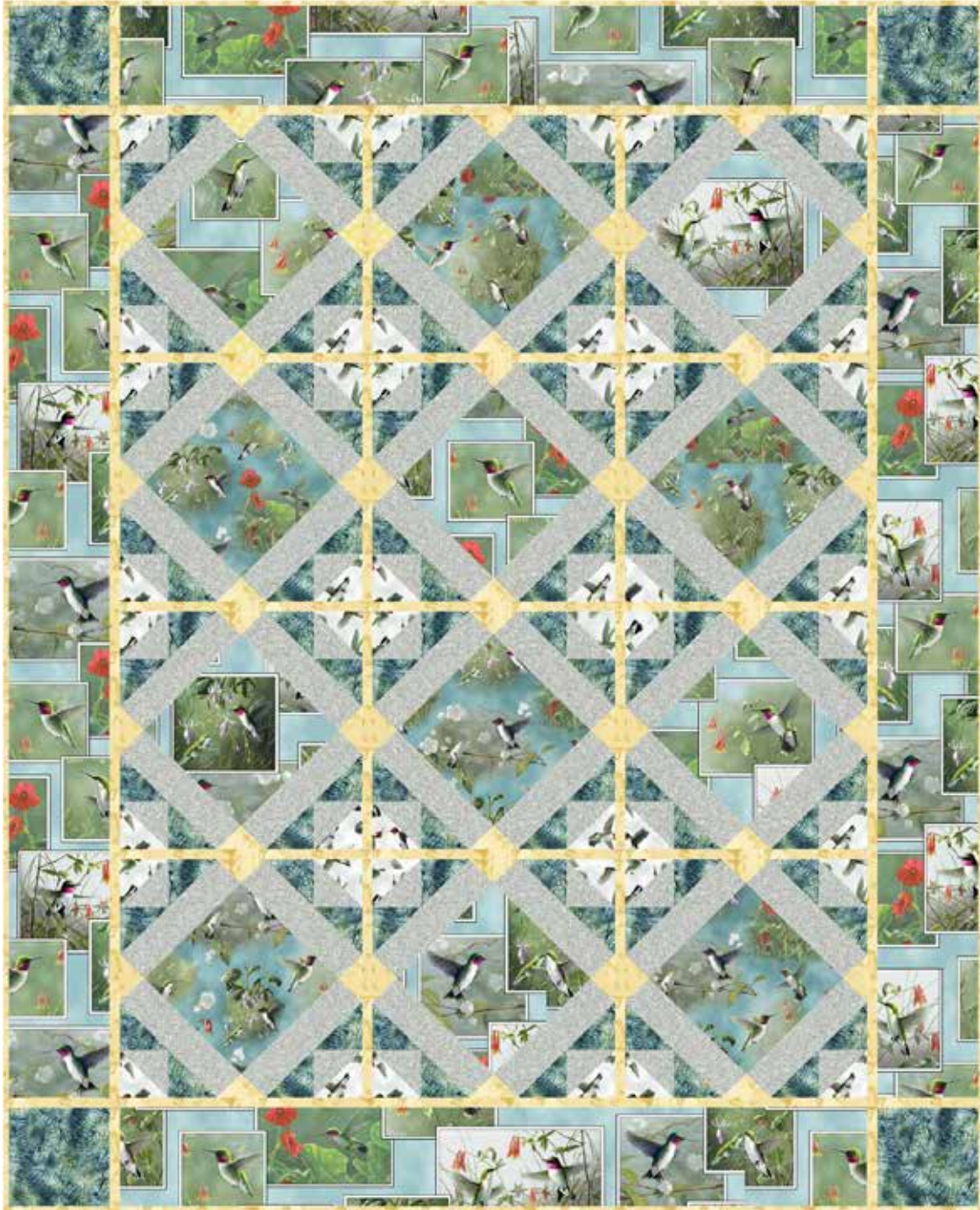
Designed By: Karla Schulz Finished Quilt Size: 48" x 60½"