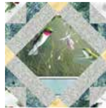
Make 6 A Blocks