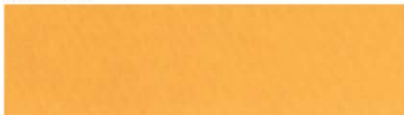
100 624-Gold Ochre