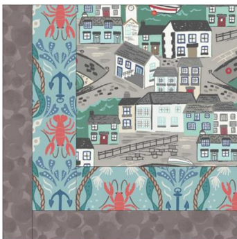
Bottom Left Block