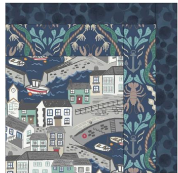
Top Right Block