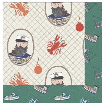
Bottom Right Block