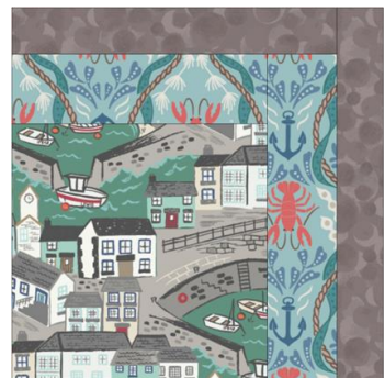
Top Right Block