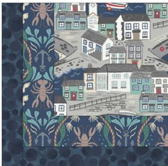
Bottom Left Block