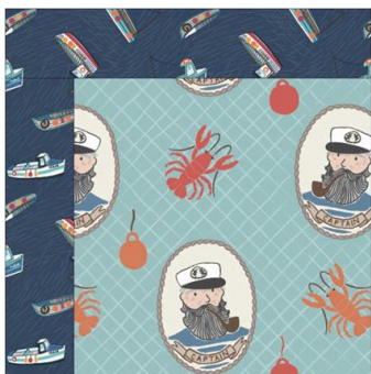
Top Left Block