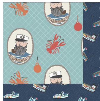
Bottom Right Block

Sew your strips to the large square left on one and right on the other one