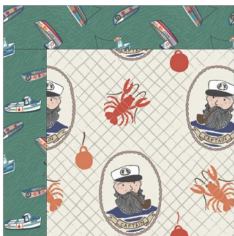
Top Left Block