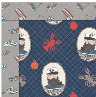
Top Left Block