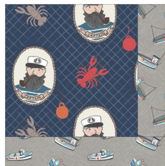
Bottom Right Block