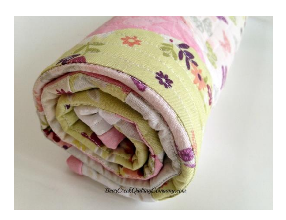
I used some Lewis and Irene Bumbleberries blenders in my project, in Cloud (gray) and Light Flamingo (pink). They really look good with the Bunny Garden prints.