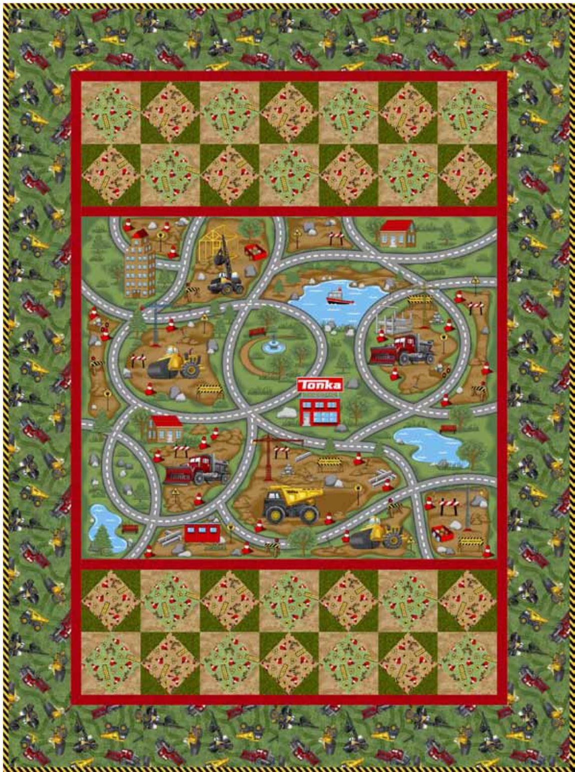
Designed By: Cyndi Hershey Finished Quilt Size: 56½" x 73"