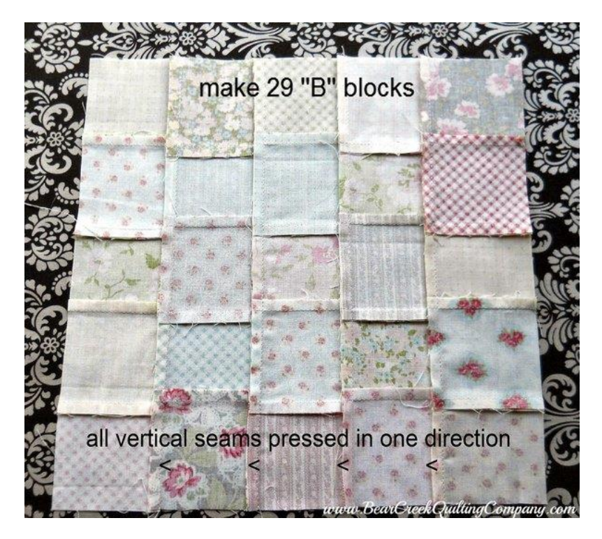
and 29 " B " blocks...