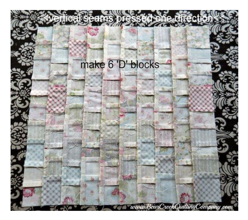
and 6 "D" blocks.