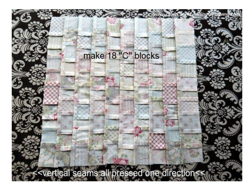
and 18 "C" blocks...