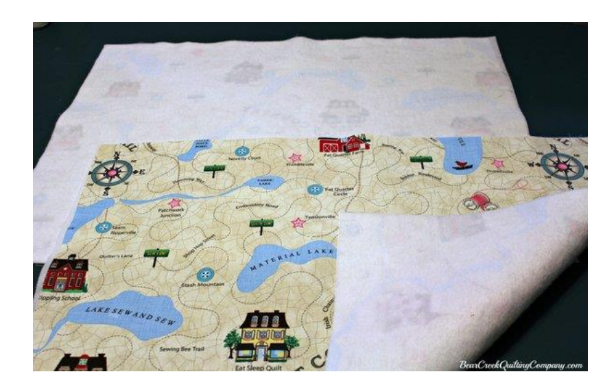
Repeat the last step, using the lining pieces and fusible batting.

Following manufacturers directions, adhere interfacing to the wrong side of the front and back pieces.