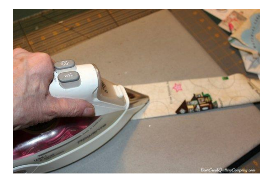
Fold each strip in half lengthwise, and press.