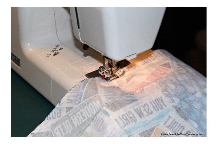
Right sides together, sew the front to a lining piece at the top edge.