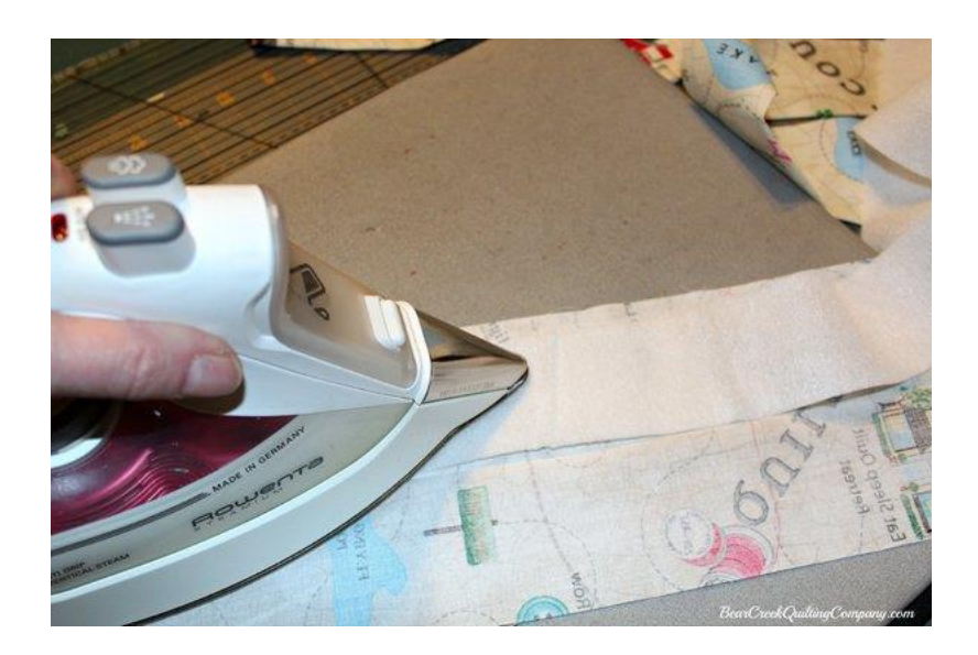
Place fusible batting close to the fold and adhere, following manufacturer's directions.