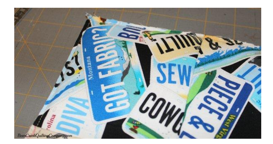
Using a \frac{1}{4} " seam, sew down both sides. Then, using \frac{1}{4} " seam, sew across bottom.

At this point, I switched to a heavy-duty jeans needle in my machine. You're going to be sewing through several layers.