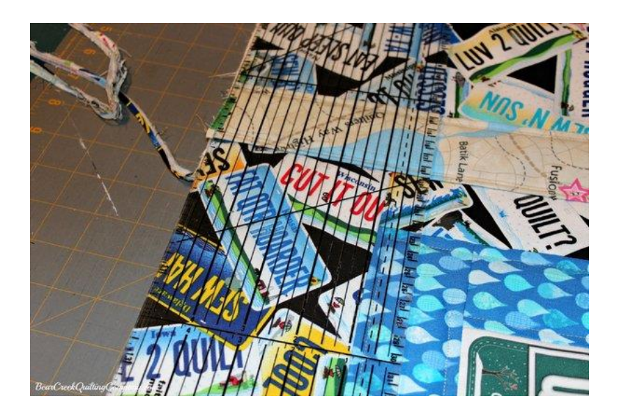
Trim seams to 1/8".