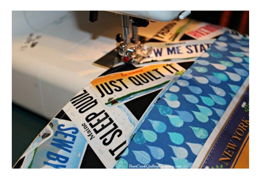
Topstitch ¼" from top edge on both front and back pieces.