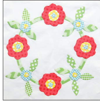
Flower Garden Block

with the outside measurement of 9" (We used the clover ½" bias tape maker)